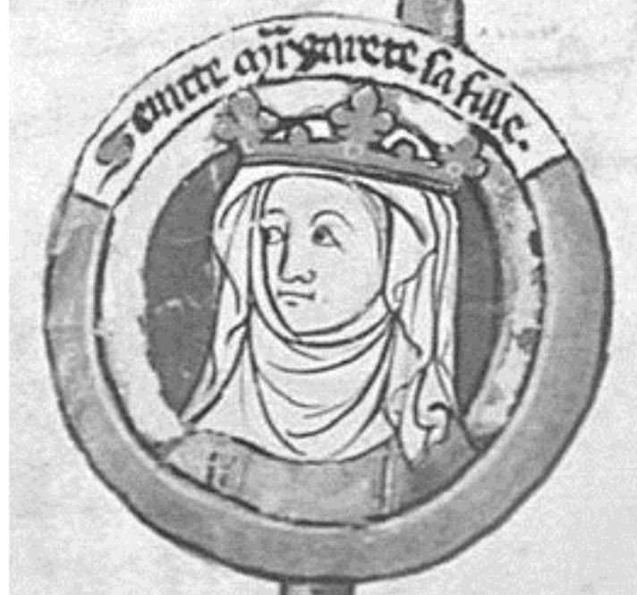
Image of Margaret from a medieval family tree

The Church formally declared her a saint in 1250 and celebrates her feast on the anniversary of her death, 16 November.