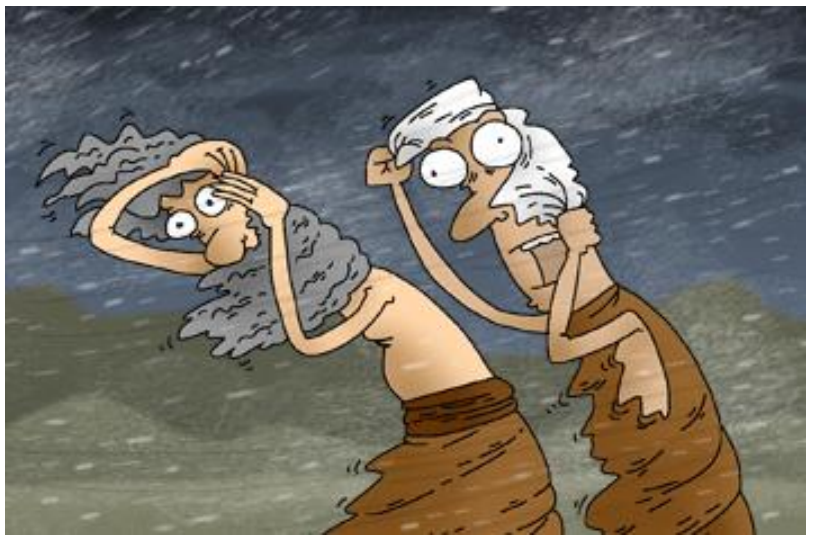
'I blame this on manna-made climate change!' (with apologies to Numbers 14)

First: Joel 2:1–2, 12–17 Epistle: 2 Corinthians 5:20b—6:10 Gospel: Matthew 6:1–6, 16–21