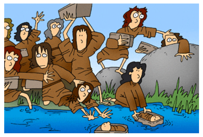
News of the success of Moses' mother's 'basket plan' sparked what would later become known as 'The great baby rush.' (with apologies to Exodus 2:1–9)